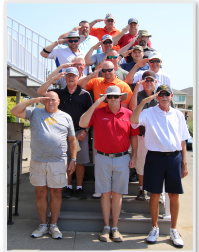
Pictured above are veterans who attended the golf tournament benefiting Midwest Honor Flight.